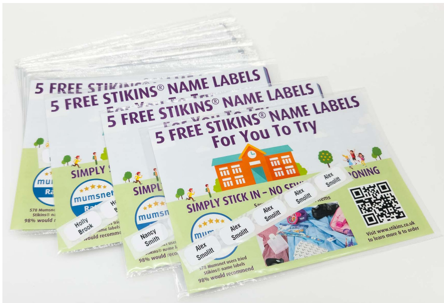
Free New Starter Samples (available in summer term).

Yes! During the past 20 years, dealing with many thousands of schools, everything we have supplied to schools and PTAs for the promotion of this fundraising scheme has been completely free of charge.